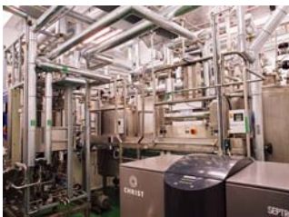
GeneMedix, Tullamore, Ireland