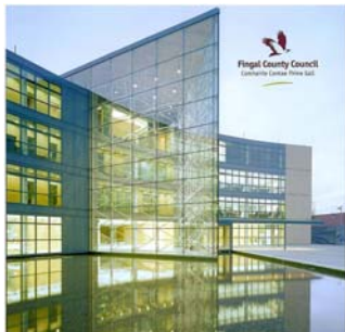
Fingal County Council, Dublin, Ireland