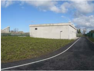
DAA Reservoir, Dublin, Ireland

Our Ireland office is located in Tallaght in Dublin. This office has successfully delivered technology-intensive projects of all sizes, ranging from less than €10,000 in fees to design/build projects exceeding €300 million.