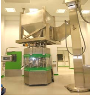
Servier UPA2 Facility, Arklow, Ireland

As a global leader in full-service engineering, project management, consulting, design, construction and operations, CH2M HILL combines international best practices with local expertise to provide solutions that add the most value to your business operations around the globe.