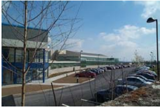
Alza Pharmaceuticals, Cashel, Ireland