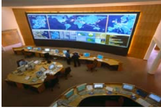
ESB, Dublin, Ireland